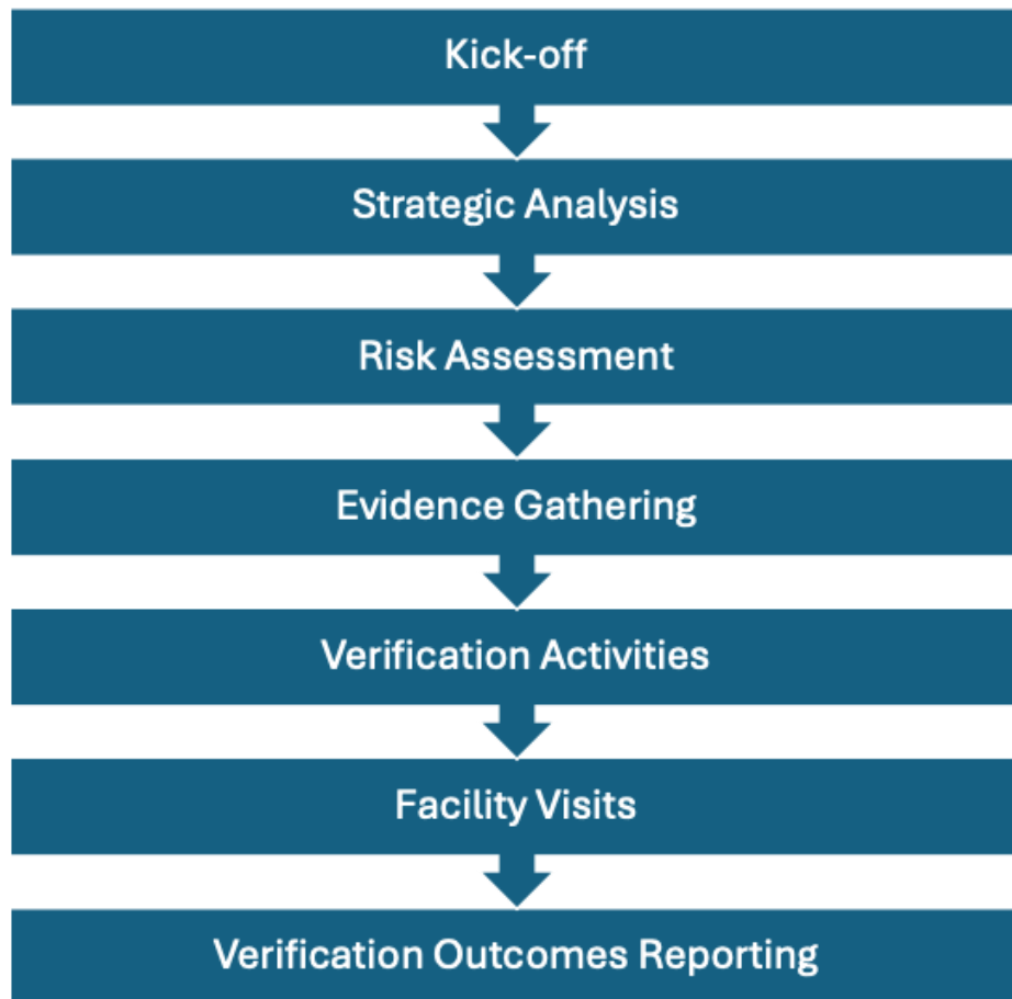
Figure 3 Typical stages of a verification engagement.

The typical stages of verification, from pre-engagement through reporting and issuance of the verification statement, are illustrated in Figure 3 below.