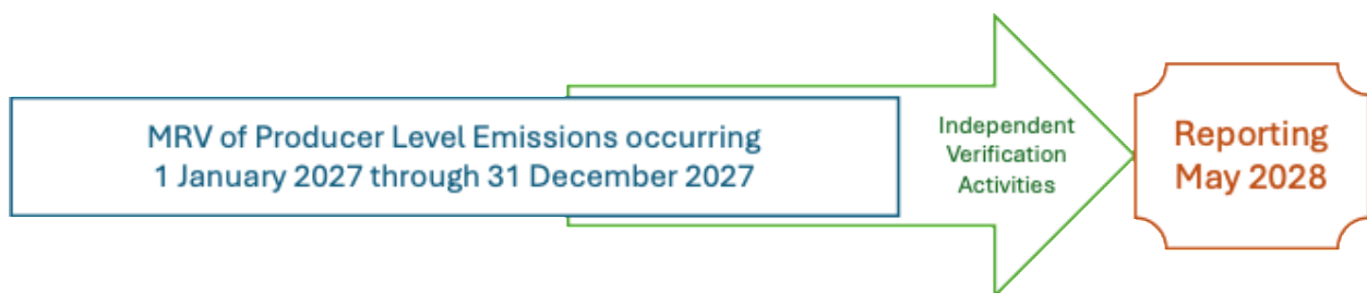
Figure 2. Example of temporal boundary of emissions data relative to reporting of such data.

Emissions reports shall cover the most recent complete calendar year. The boundary definition, including organisational and geographic scope, shall be reviewed and confirmed annually to ensure it remains accurate and complete. In cases where part or all of an asset is acquired or divested during the reporting year, the operator may limit reporting for those portions of the asset to the periods under its operational control. Such cases must be clearly documented in the emissions report, including a description of the boundaries applied and the circumstances of the change in control. Such limitations shall not be used to exclude facilities or periods in a manner that would materially distort the asset-level emissions profile.